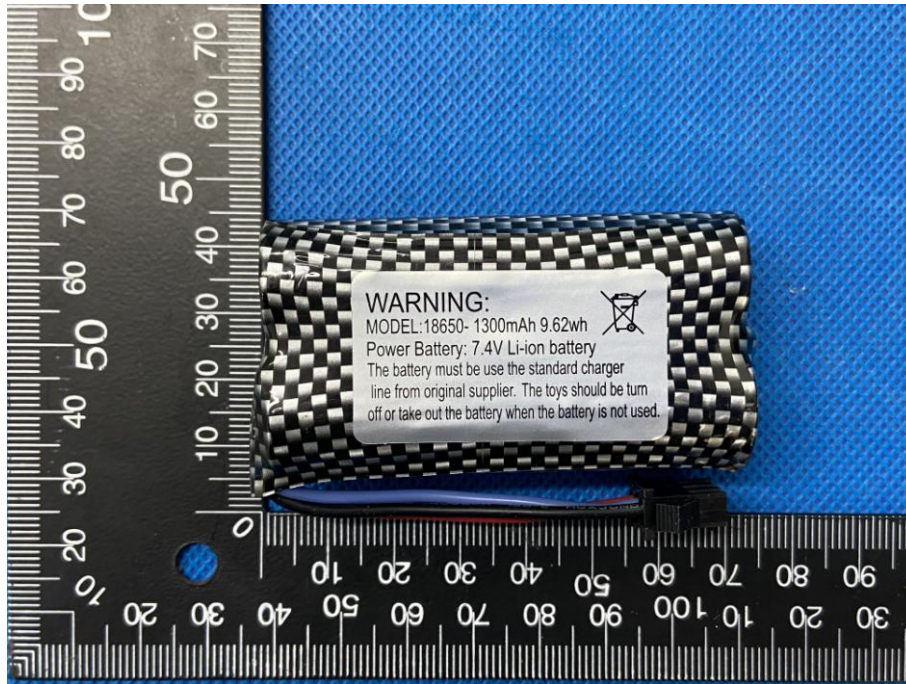
Fig. 1 – Front view of Battery