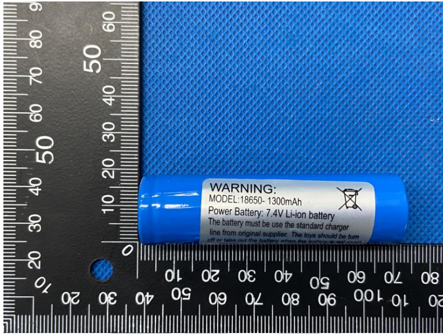
Fig. 3 – Front view of Cell